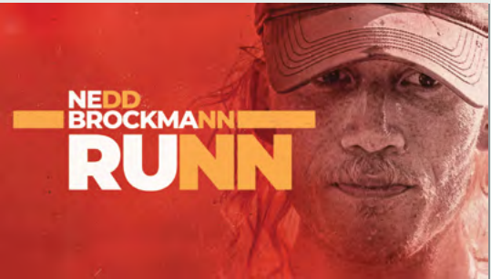
RUNN - THE NEDD BROCKMANN DOCUMENTARY

In the rugged and awe-inspiring landscapes of Australia, Nedd Brockmann, a quintessential Aussie bloke with a wicked sense of humor, embarks on a daring and unprecedented mission: a remarkable solo run spanning the vast continent of Australia.