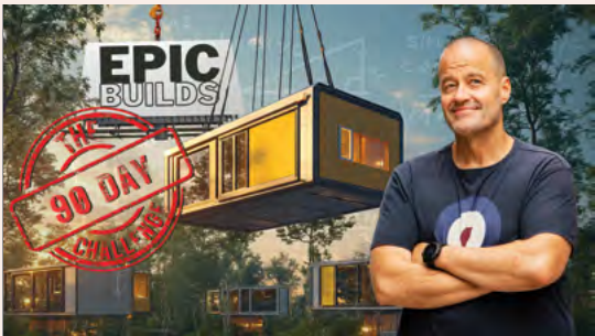
EPIC BUILDS - THE 90 DAY CHALLENGE NEW SHOW

What do you get when you combine extreme deadlines, wild locations, and the boldest modular construction projects in the Southern Hemisphere? EPIC Builds: The 90 Day Challenge follows Australia's top prefab and modular builders as they race to complete architectural marvels — in just 90 days.