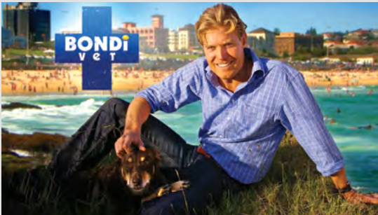
BONDI VET - SEASONS 1 - 8

Produced by WTFN Entertainment for Nine Network Australia, Animal Planet US and TF1