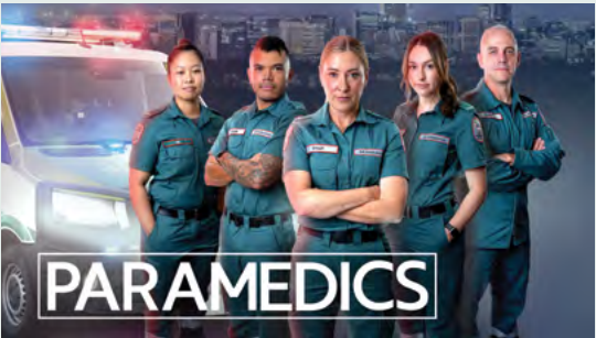
PARAMEDICS NEW SEASON

Produced by WTFN Entertainment for Seven Network Australia