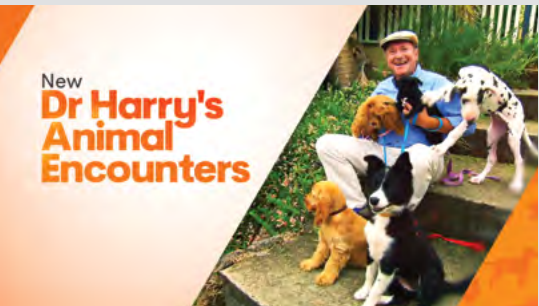
DR HARRY'S ANIMAL ENCOUNTERS

Produced By Magnetic Pictures and Rockpool Media