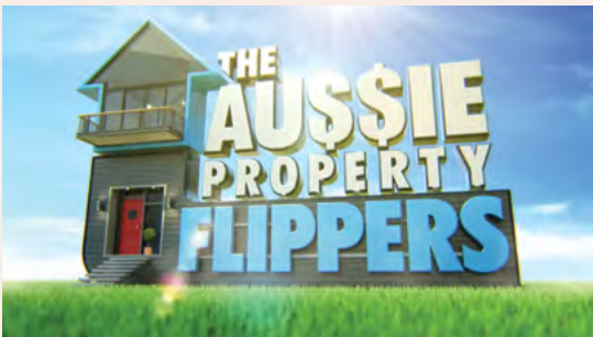
THE AUSSIE PROPERTY FLIPPERS

This factual entertainment series follows 12 couples game enough to roll the dice and bet everything on purchasing, renovating and selling homes for a profit! Each closed episode features 2 separate property flips, 2 whole house reveals and 2 final sale results, with plenty of DIY tips along the way.