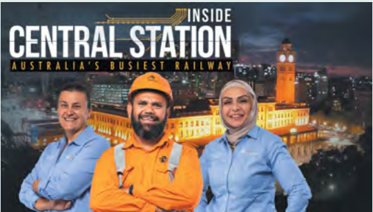
INSIDE CENTRAL STATION: AUSTRALIA'S BUSIEST RAILWAY

Produced by WTFN Entertainment for Seven Network Australia