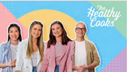
THE HEALTHY COOKS