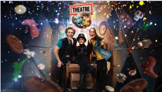
THEATRE DOME NEW SHOW

Step inside the Theatre Dome ! An entertaining and unconventional improv comedy show like no other.