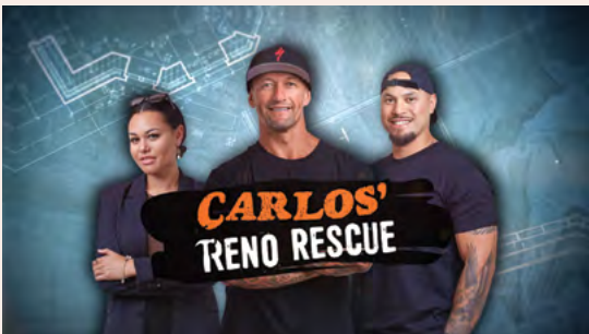
CARLO'S RENO RESCUE

Carlos Spencer was a mercurial genius on the rugby field known for his flamboyance in 35 tests for the All Blacks, and an outstanding Super Rugby career with the Blues and Māori All Blacks.