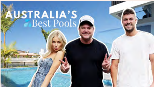
AUSTRALIA'S BEST POOLS NEW SHOW