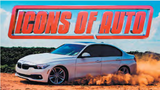
ICONS OF AUTO

The icons are famous, the emblems are iconic, and the machines are lust-worthy. Just whispering their name conjures passion and fantasy.