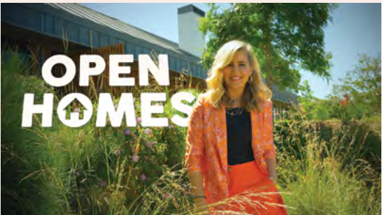
OPEN HOMES NEW SHOW

Take a tour through some of the most awe-inspiring homes you'll ever see.