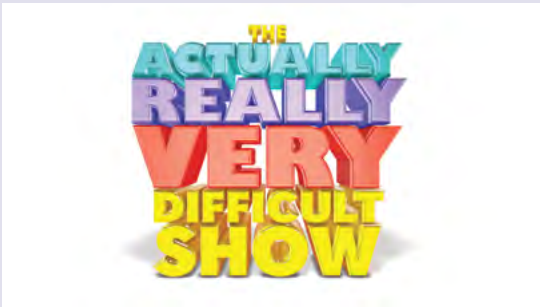
ACTUALLY REALLY VERY DIFFICULT SHOW

Produced by Three’s A Company for Seven Network Australia