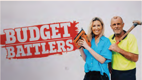
BUDGET BATTLERS NEW SEASON

Produced by Farpoint Films for Paramount +