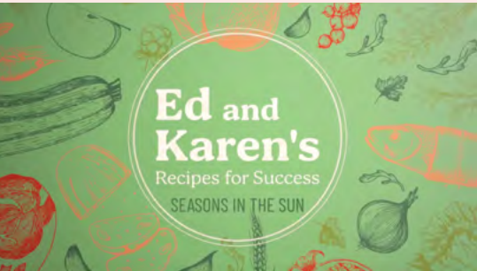
ED AND KAREN’S RECIPES FOR SUCCESS

Hosted by two of Australia’s much-loved TV chefs and food authors, Ed ‘Fast Ed’ Halmagyi and Karen Martini, Recipes for Success features hundreds of Karen and Ed’s most popular and enduring recipes. The series brings all their knowledge and cooking know-how together in one tantalising gourmet extravaganza. This is hands-on cooking for everyone... from mid week meals on the table in less than twenty minutes, to decadent desserts and dinner party winners – guaranteed to wow your family and friends.