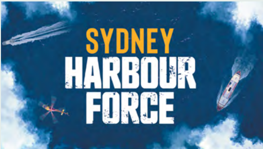
SYDNEY HARBOUR FORCE

Produced by WTFN Entertainment for Seven Network Australia