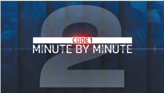
CODE 1: MINUTE BY MINUTE

Produced by WTFN Entertainment for Discovery UK/ANZ and Seven.One Entertainment Group