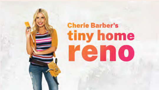
CHERIE BARBER'S TINY HOME RENO NEW SHOW

Renovation queen Cherie Barber takes on her boldest challenge yet: transforming a tiny Sydney apartment into a luxe, high-end home in just one week. In this one-hour special, Cherie reveals her Renovating for Profit strategies step by step—proving that smart design, determination, and a sharp eye for style can turn even the smallest space into a stunning property. Part masterclass, part makeover, and packed with practical inspiration, Cherie Barber's Tiny Home Reno shows how anyone can start flipping spaces and unlock big potential from tiny beginnings.