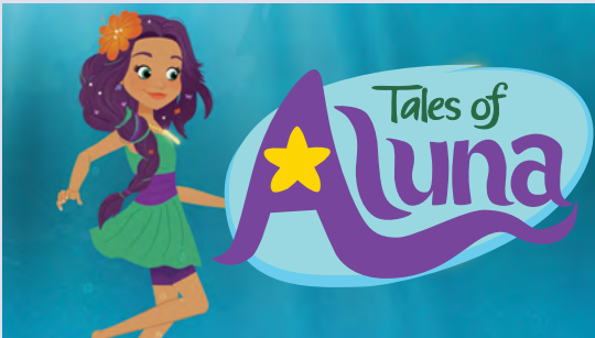
TALES OF ALUNA

Half-spirit and half-human girl, Aluna inhabits a mysterious and magical floating island - a remnant of the legendary Atlantis. The Island is a wonderful floating sanctuary that Aluna has sworn to protect. Aluna possesses a deep and intuitive understanding of the animal and natural worlds. She can speak the languages of several species, including penguin, dolphin, bird, a smattering of starfish and, of course, human.