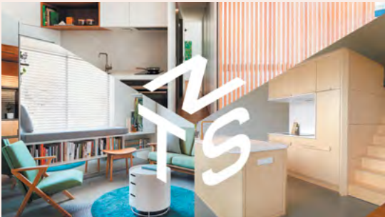
NEVER TOO SMALL

Produced by Rachel and Ryan productions for Nine Network Australia