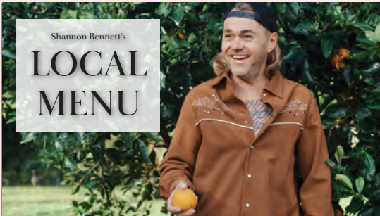
LOCAL MENU WITH SHANNON BENNETT NEW SHOW

A chef’s road trip across Australia — from dirt to dish, where local produce meets world class plates. World-renowned chef Shannon Bennett embarks on a journey across Australia to uncover the country’s finest produce. From regenerative farms to wild coastlines, we trace ingredients from the source to the pass at world-class restaurants. Along the way, Shannon and Australia’s top chefs reveal how better farming creates food that’s richer in taste and nutrients. This is a series that proves: to cook world-class, you must grow world-class.