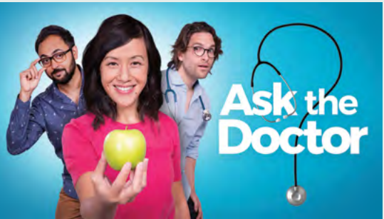
ASK THE DOCTOR

Produced by WTFN Entertainment for the Australian Broadcasting Corporation