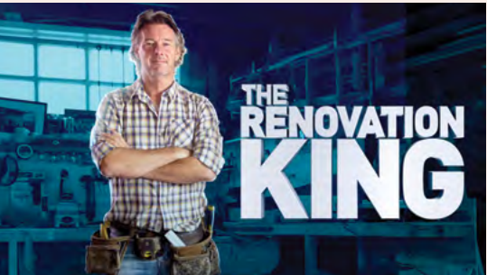
THE RENOVATION KING

Produced by North Light Productions and Maker Media for Nine Network Australia