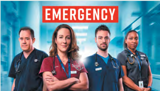
EMERGENCY NEW SEASON

Produced by WTFN Entertainment for Seven Network Australia