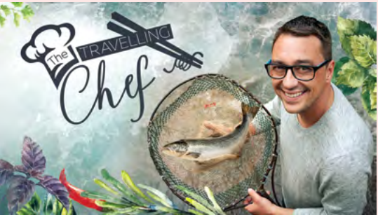
THE TRAVELLING CHEF

Produced by Bengar Films for Nine Network Australia