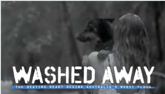
WASHED AWAY NEW SHOW

Washed Away is the gripping true story of the Northern Rivers floods—one of Australia’s worst natural disasters. As waters rose and systems failed, locals became heroes, risking their lives to save others. This powerful documentary captures a community’s fight for survival, the heartbreak of loss, and a call for accountability in the face of crisis. A raw, inspiring tribute to human courage and resilience.