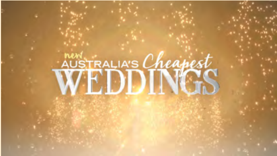
AUSTRALIA'S CHEAPEST WEDDINGS

It's the day all brides dream of - their wedding day - and most Aussie couples splurge an average of $65,000 to achieve their perfect day.