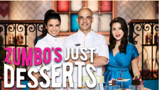
ZUMBO'S JUST DESSERTS

Produced by Cry Havoc Productions for MotorTrend (Discovery Italy)