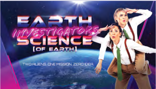
EARTH SCIENCE INVESTIGATORS

If aliens came to Earth, what would they think of humans – the way we act, how our bodies function, what we rely on each day, how we choose to spend our time?