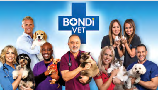
BONDI VET - SEASONS 9 - 14

International best-selling vet series, Bondi Vet has undergone a re-boot, with an all-new cast from across Australia and beyond.