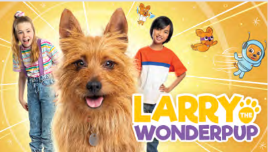
LARRY THE WONDERPUP AND LARRY THE WONDERPUP ANIMATION

Get ready for Larry the Wonderpup , one super-cute pooch who will win kids’ hearts with his irresistible tales and fantastic antics. Every day, Larry and his owner, Sasha, embark on adventures, exploring the wonders of the real world and the realms of make-believe.