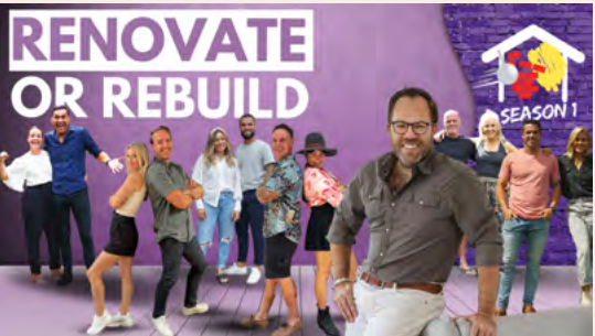
RENOVATE OR REBUILD NEW SHOW

But whether your style is modern, industrial, mid-century or your own unique style - in each episode our teams will take you through the 4 key steps you should think about for any renovation or rebuild to make sure your home is healthy, efficient and comfortable.