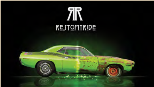
RESTO MY RIDE NEW SEASON