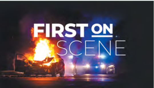
FIRST ON SCENE

Produced by WTFN Entertainment for Nine Network Australia, TVNZ