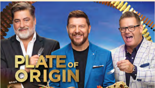
PLATE OF ORIGIN

Food superstars Matt Preston and Gary Mehigan join Manu Feildel for Plate of Origin , an original format that sees teams of home cooks, representing their cultural heritage, compete to see whose cuisine is the best.