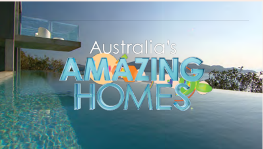
AMAZING AUSTRALIAN HOMES